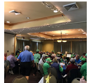
Silent Auction Picture